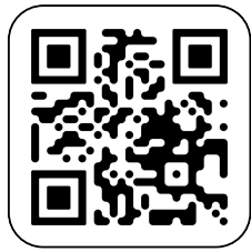
CelloPark app download

University of the Sunshine Coast 90 Sippy Downs Drive, SIPPY DOWNS QLD 4556 Tel: 07 5430 1129 Email: venues@UniSC.edu.au